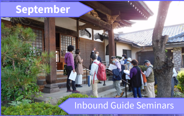
Inbound Guide Seminars