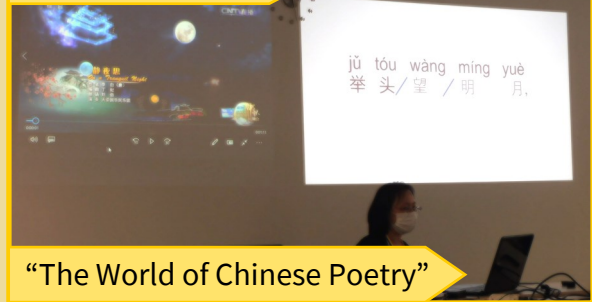
"The World of Chinese Poetry"