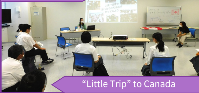
"Little Trip" to Canada