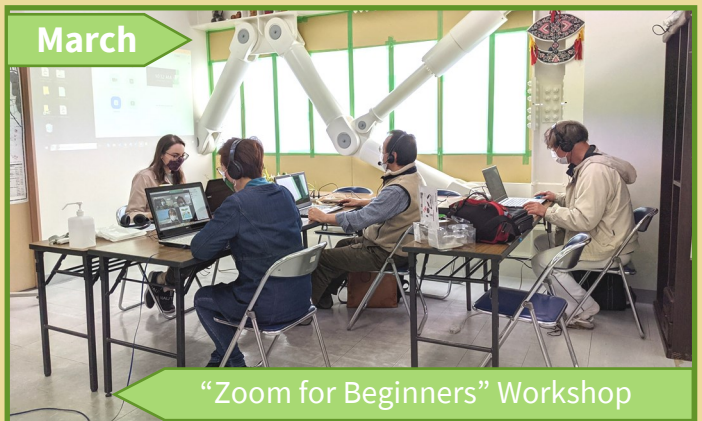
"Zoom for Beginners" Workshop