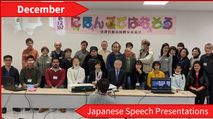
Japanese Speech Presentations