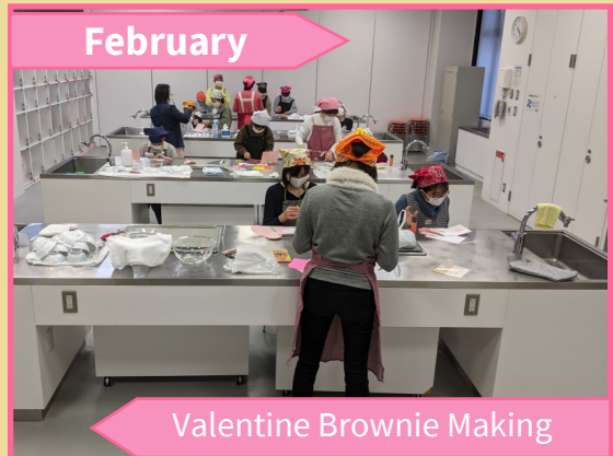
Valentine Brownie Making