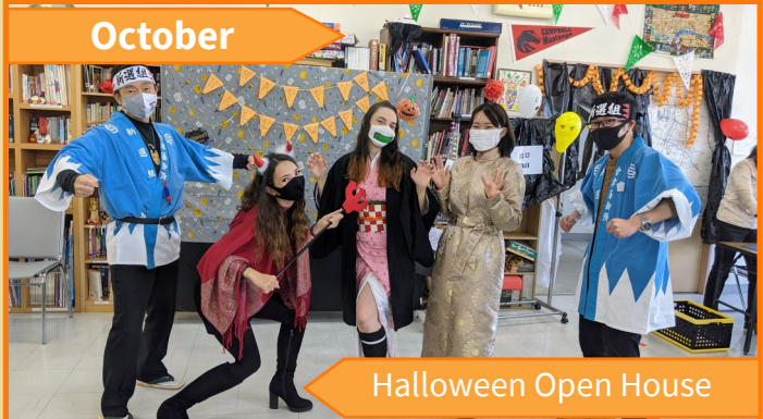
Halloween Open House